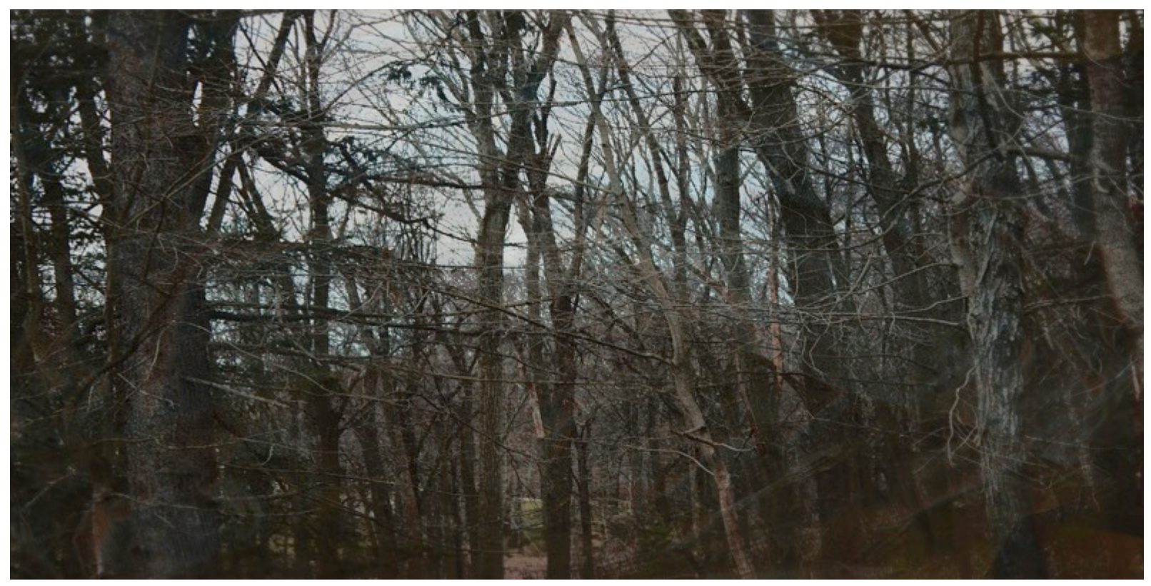
Panorama 118 AP 23 x 43" archival pigment print 2018