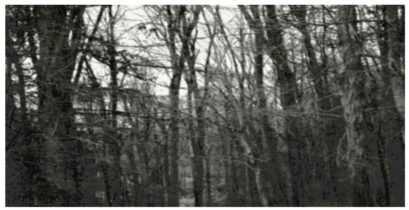
Metaphor 2218 AP 23 x 43" archival pigment print 2018