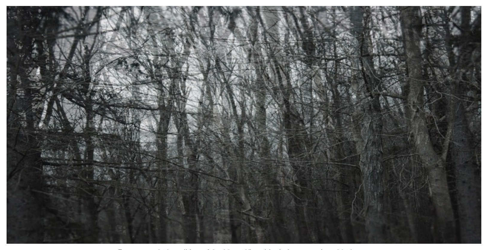
Panorama 218 edition of 2 23 x 43" archival pigment print 2018