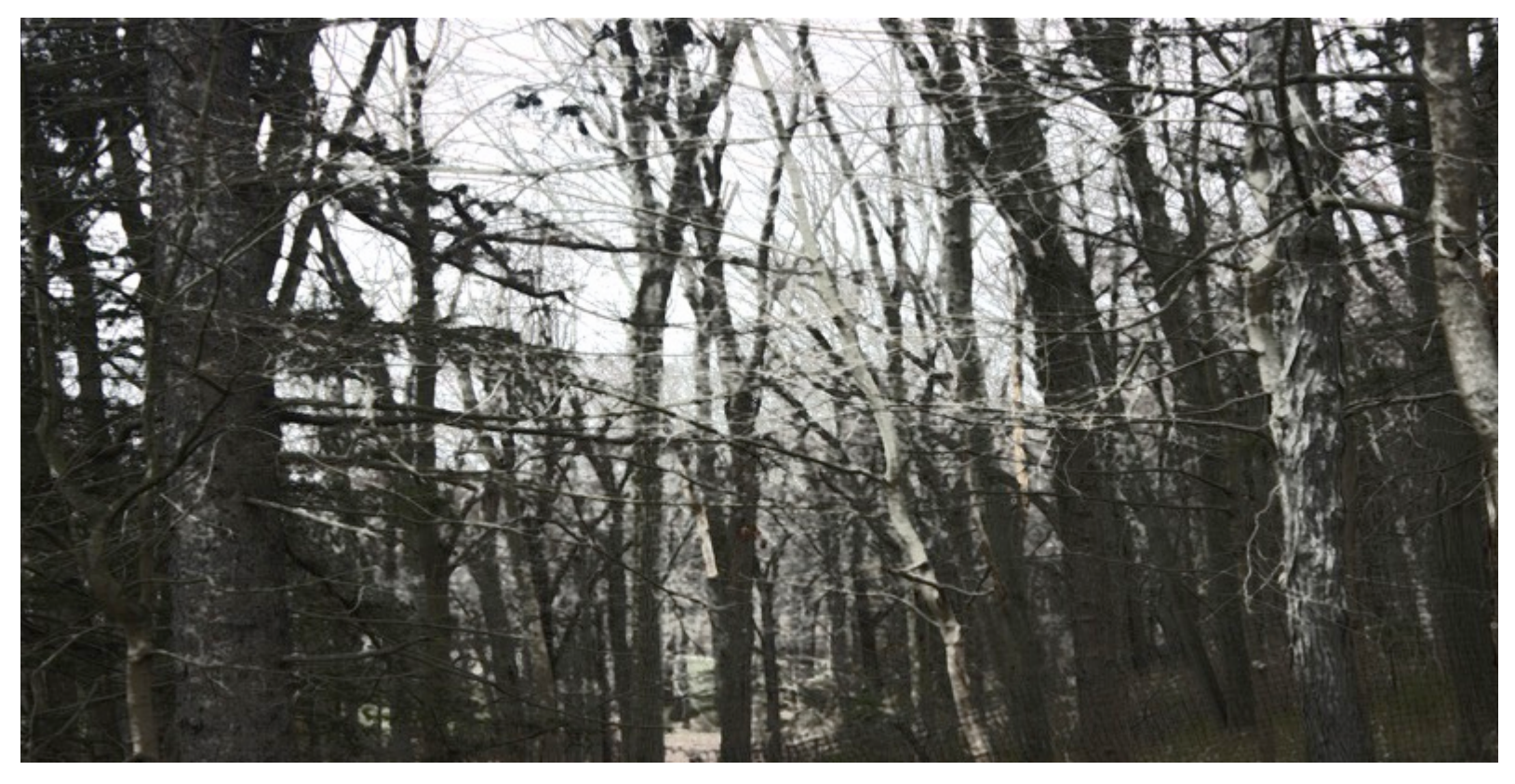
Metaphor 0418 AP 23 x 43" archival pigment print 2018