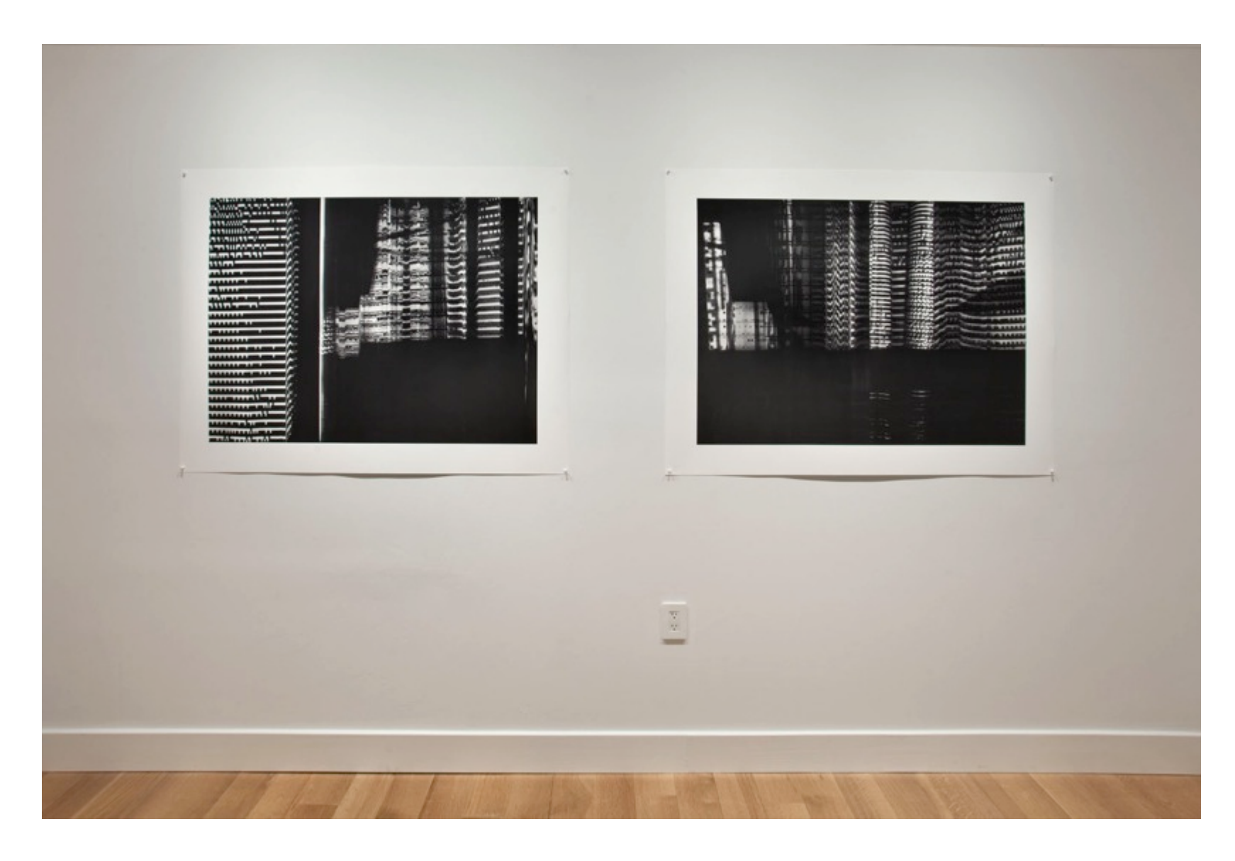
DRAPE © 2016 24 x 31" on 30 x 40" paper archival pigment print