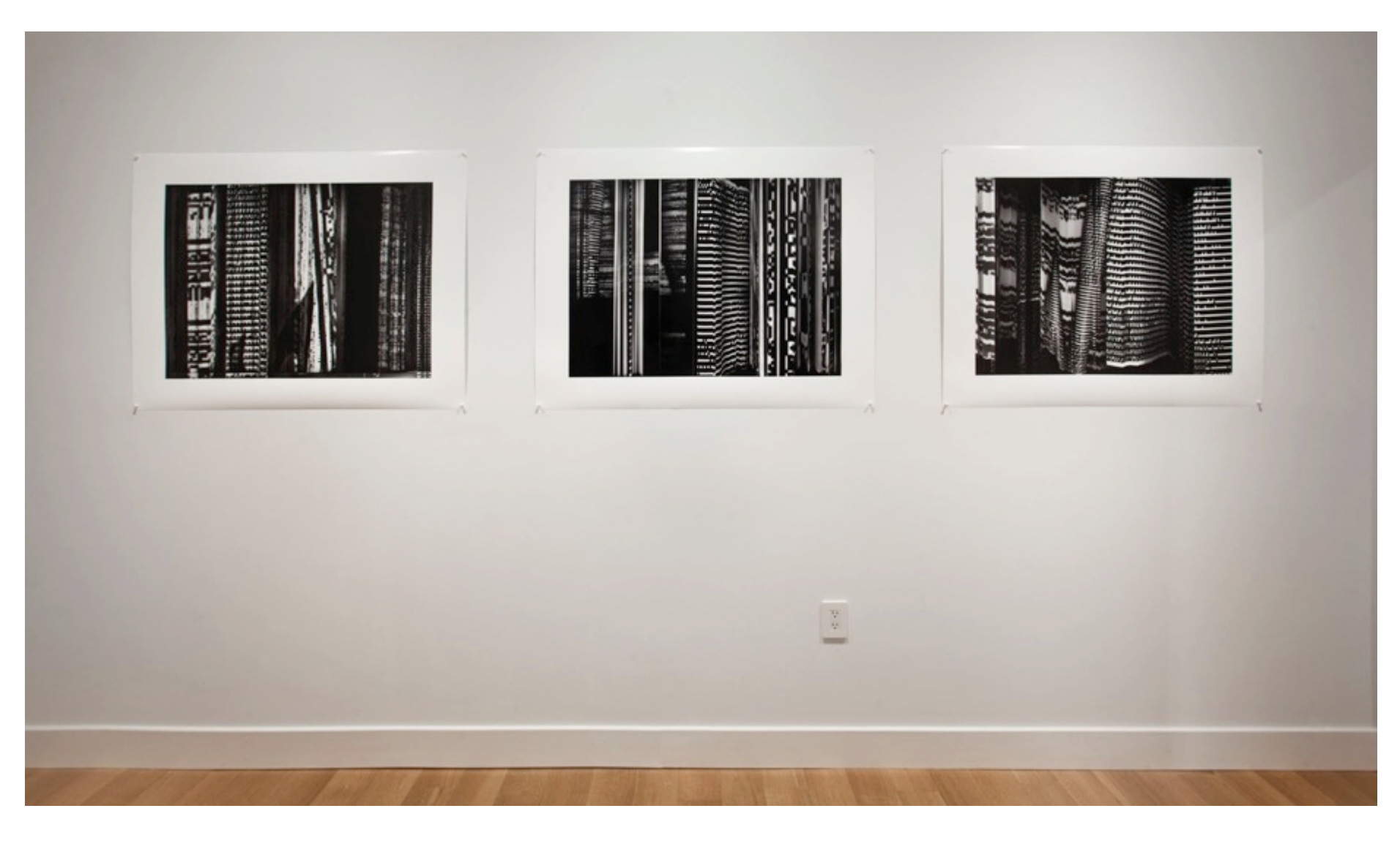
DRAPE © 2016 24 x 31" on 30 x 40" paper archival pigment print