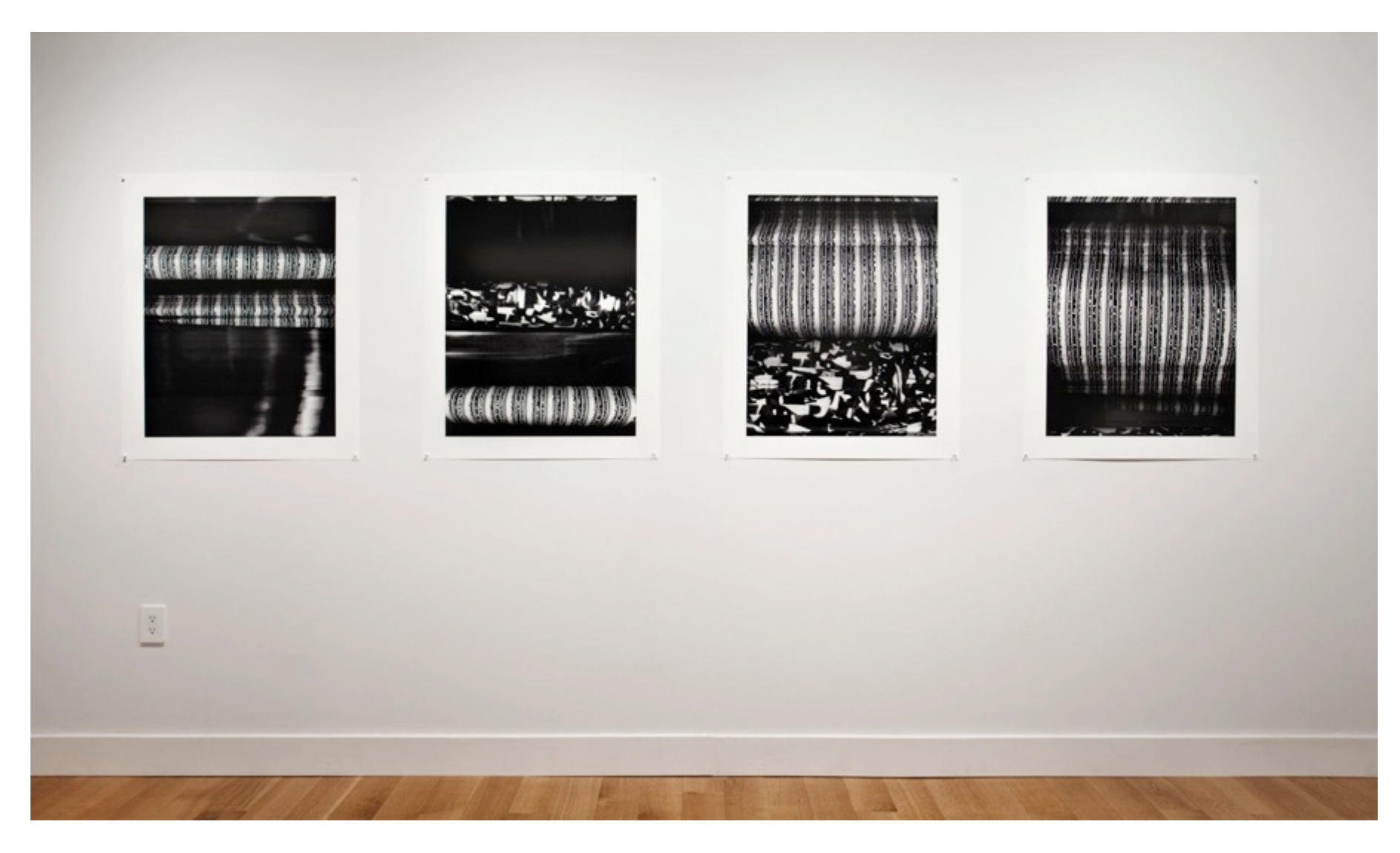
OFFSET © 2016 24 x 31" on 30 x 40"on paper archival pigment print