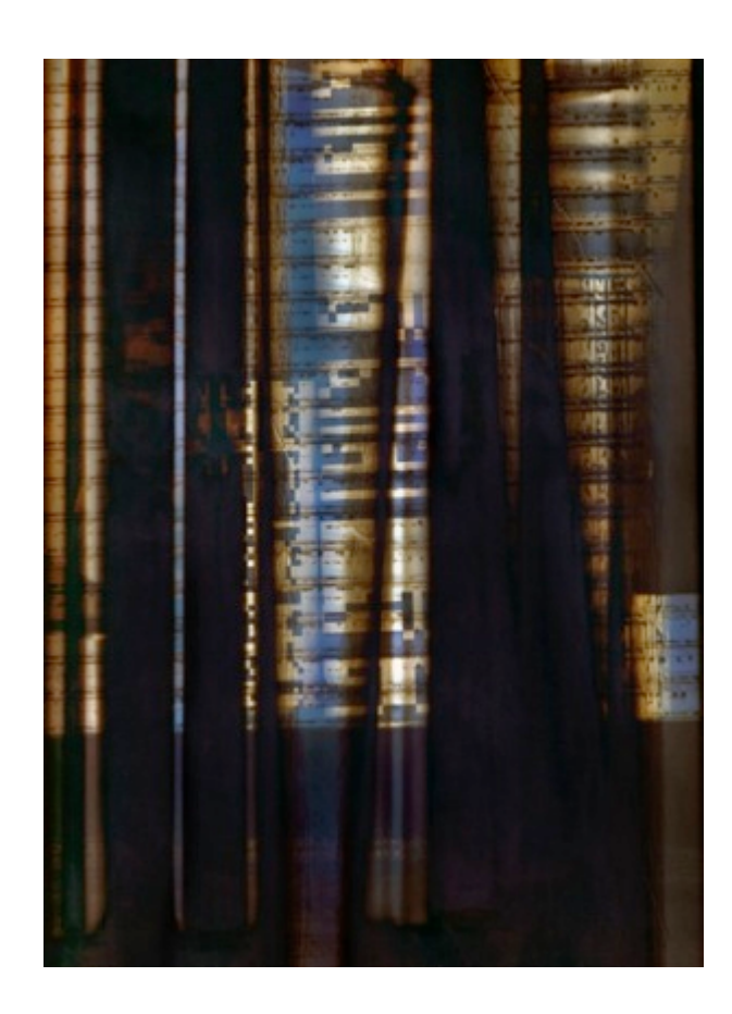
SACRED © 2016 24 x 31"on 30 x 40" paper archival pigment print