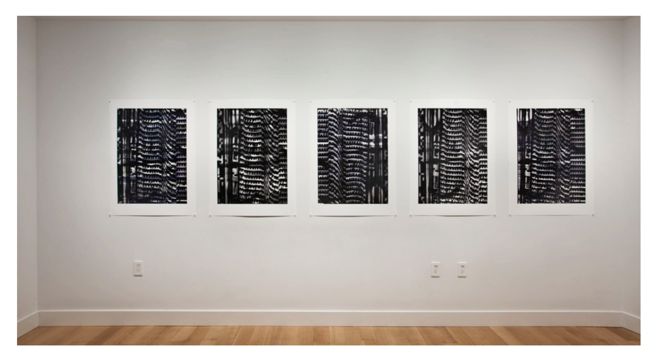
METROPOLIS © 2016 24 x 31" on 30 x 40" paper archival pigment print