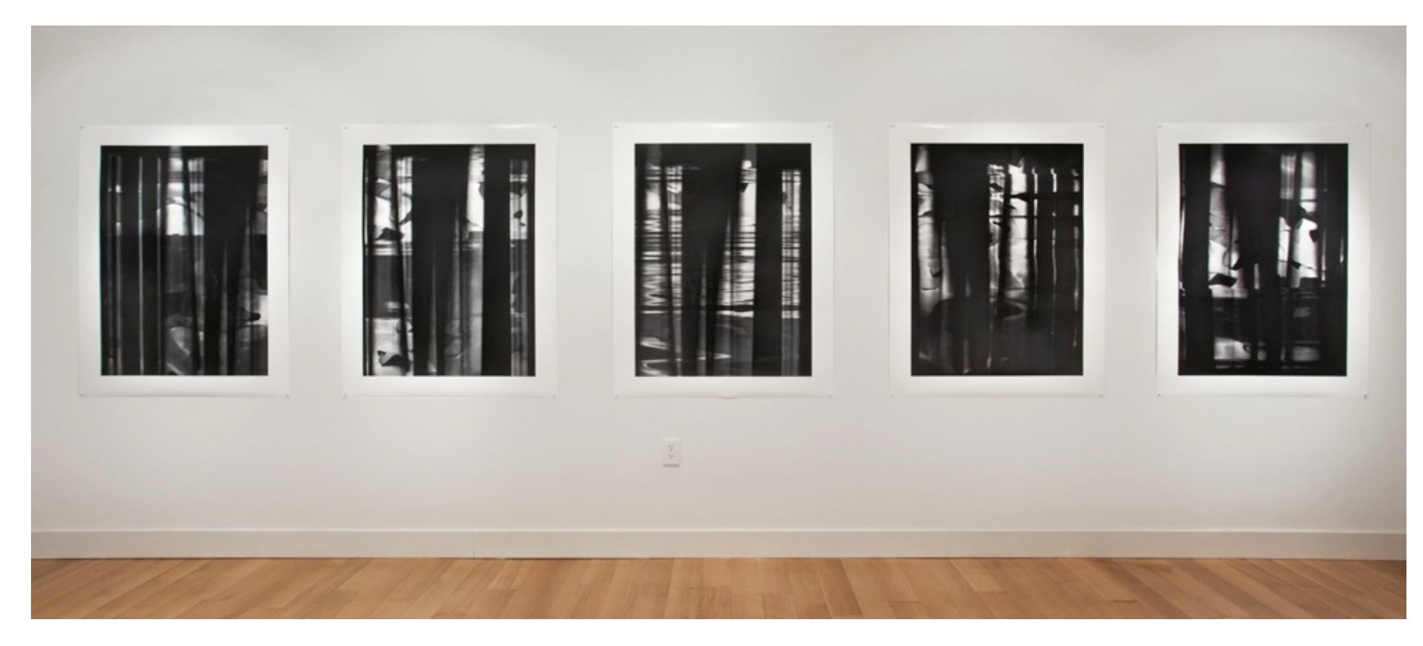
GLIMPSE © 2016 32 x 42" on 40 x 50" paper archival pigment print