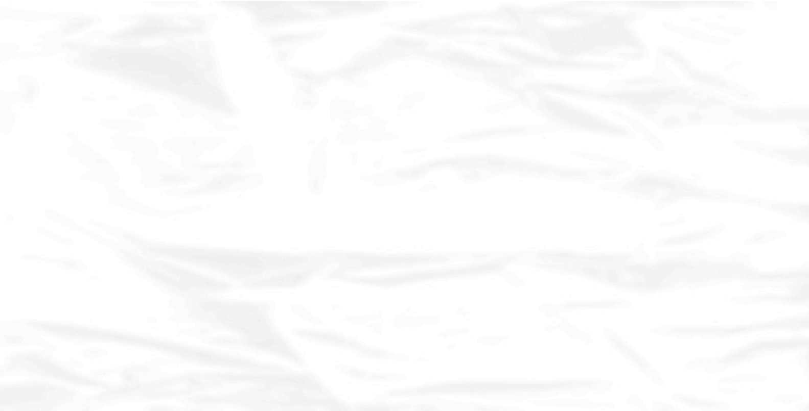
Lens 0618 AP 23 x 43" archival pigment print 2018