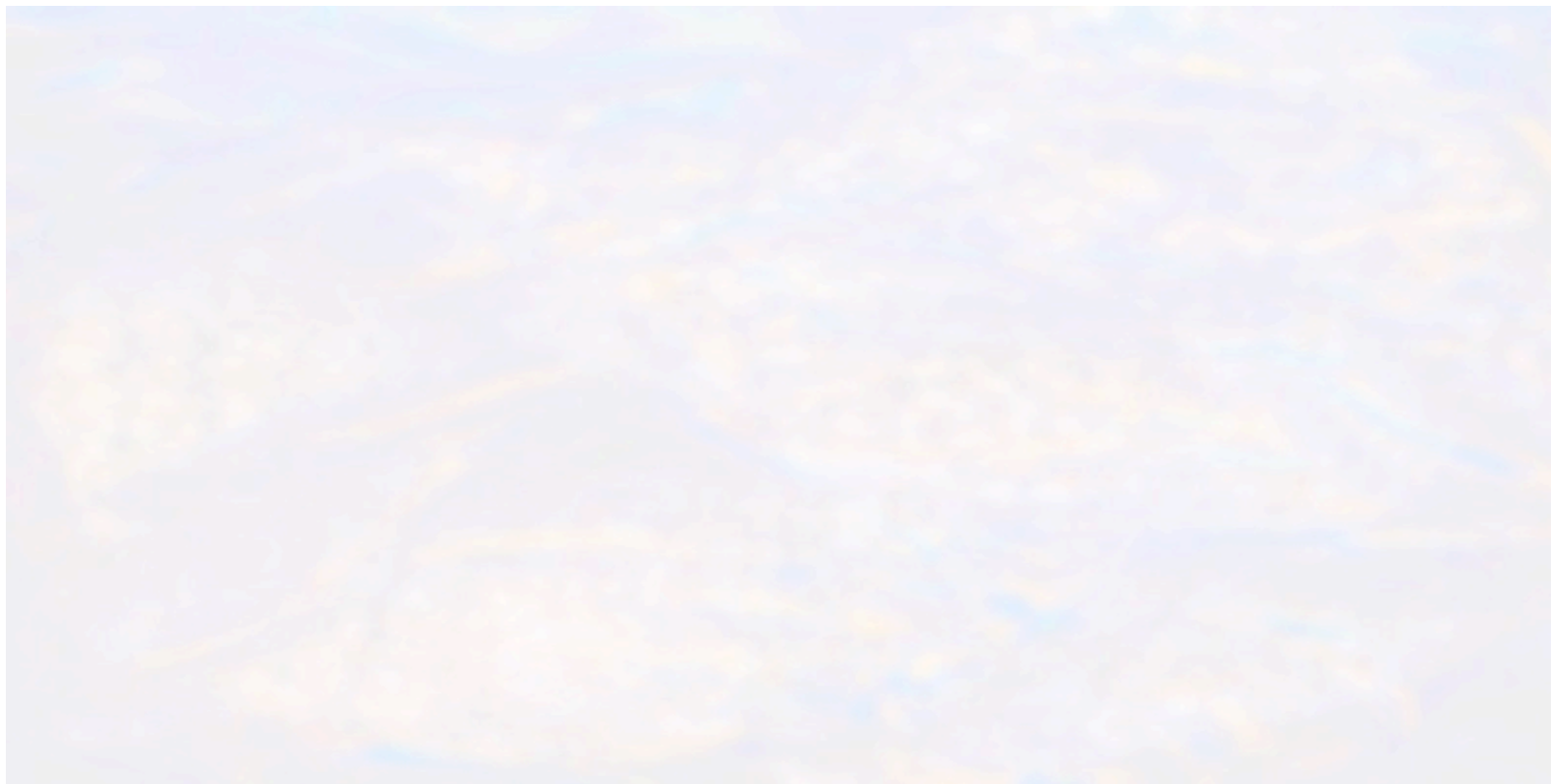
Filter 0718 AP 23 x 43" archival pigment print 2018