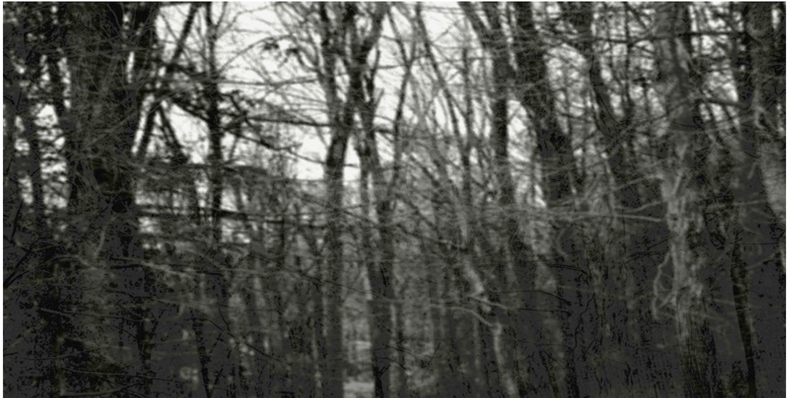
Metaphor 2218 AP 23 x 43" archival pigment print 2018