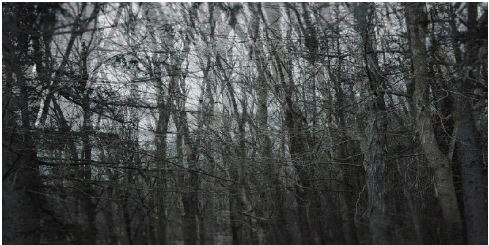
Panorama 218 edition of 2 23 x 43" archival pigment print 2018