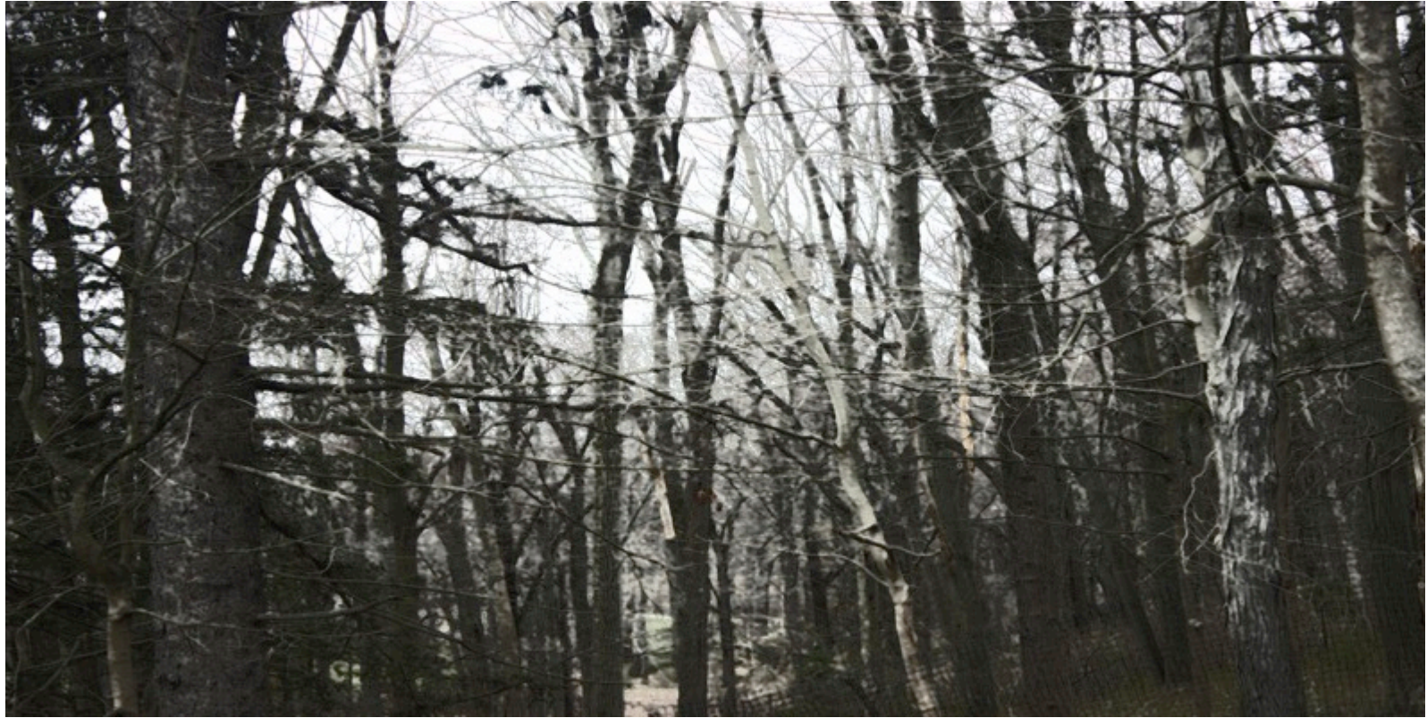
Metaphor 0418 AP 23 x 43" archival pigment print 2018