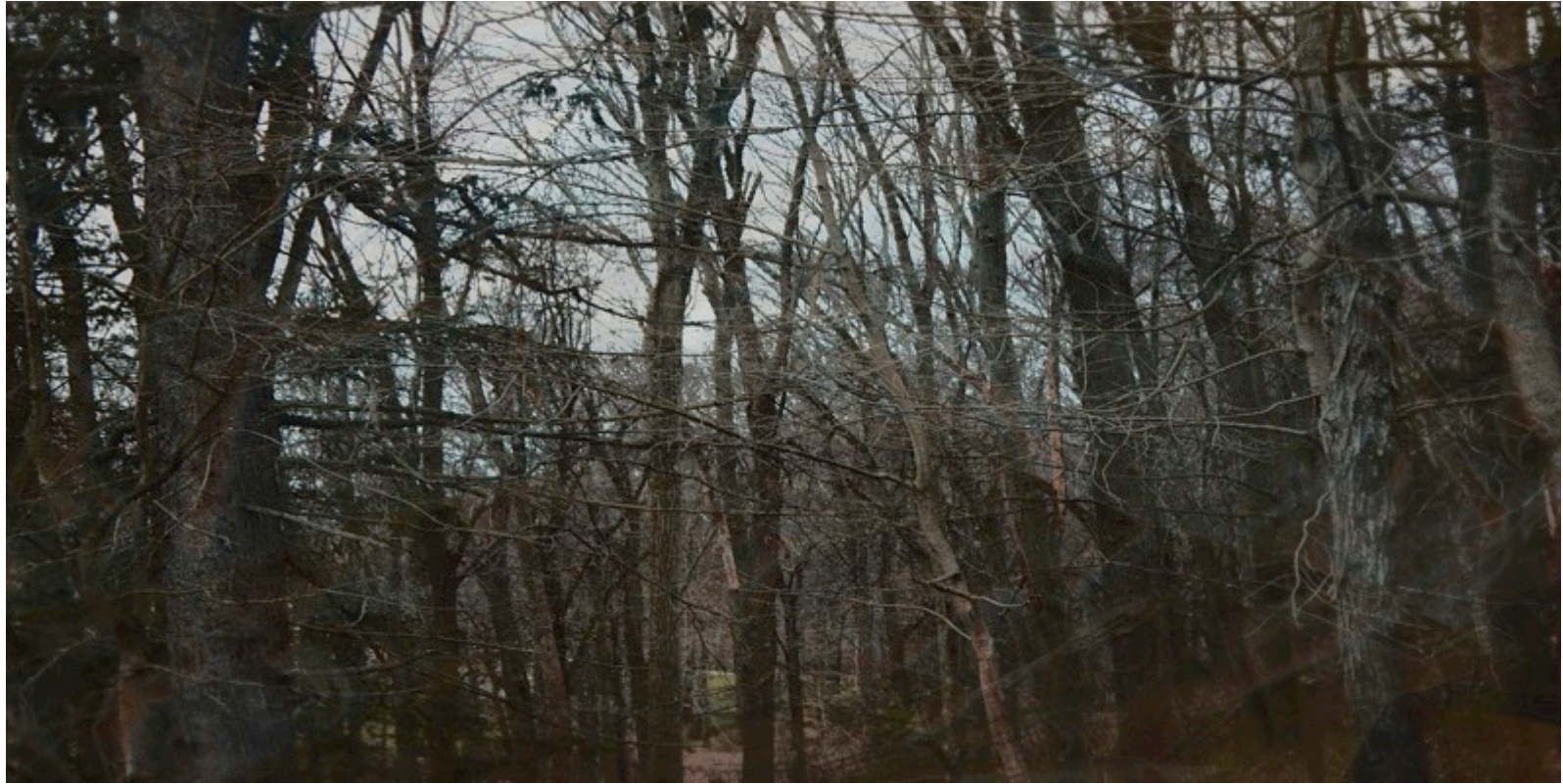
Panorama 118 AP 23 x 43" archival pigment print 2018