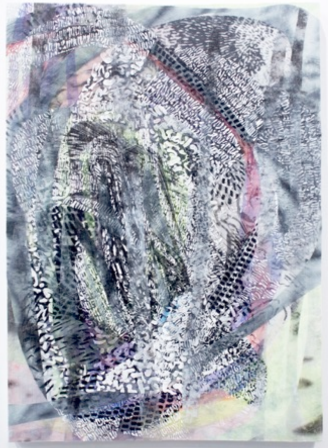
Left Blindsight 519 28 x 20 x 1.75" layered acrylic and digital transfer on concave panel 2019