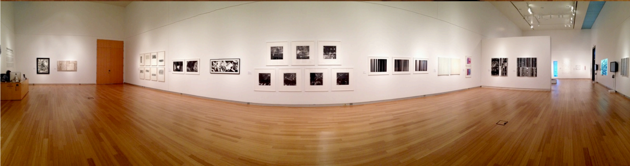
Berkshire, Reese & Paul Galleries Herron School of Art September 28 to November 9, 2016