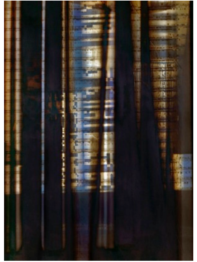
SACRED © 2016 24 x 31" on 30 x 40" paper archival pigment print