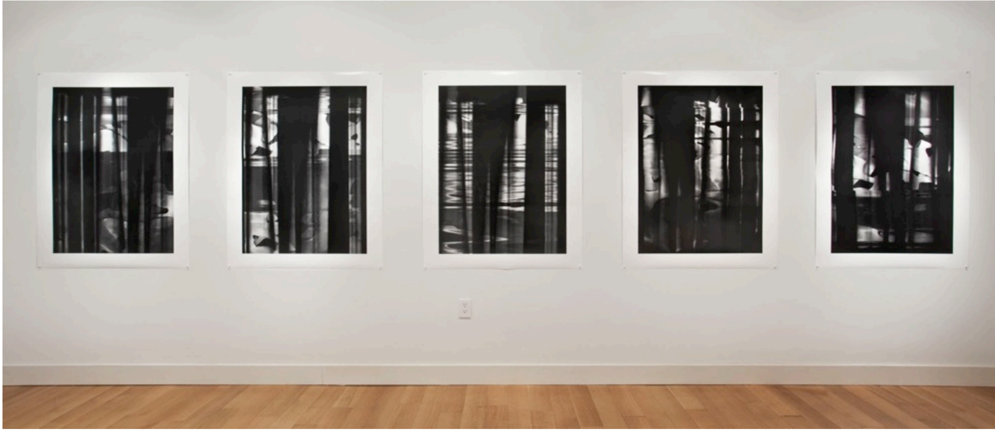
GLIMPSE © 2016 32 x 42" on 40 x 50" paper archival pigment print