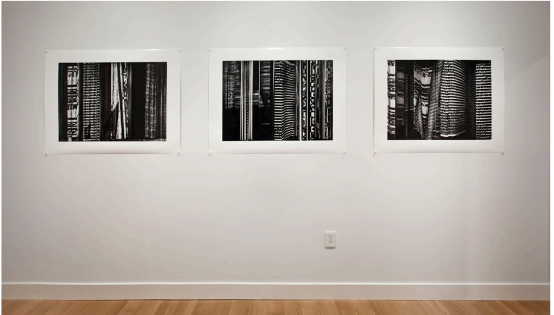
DRAPE © 2016 24 x 31" on 30 x 40" paper archival pigment print