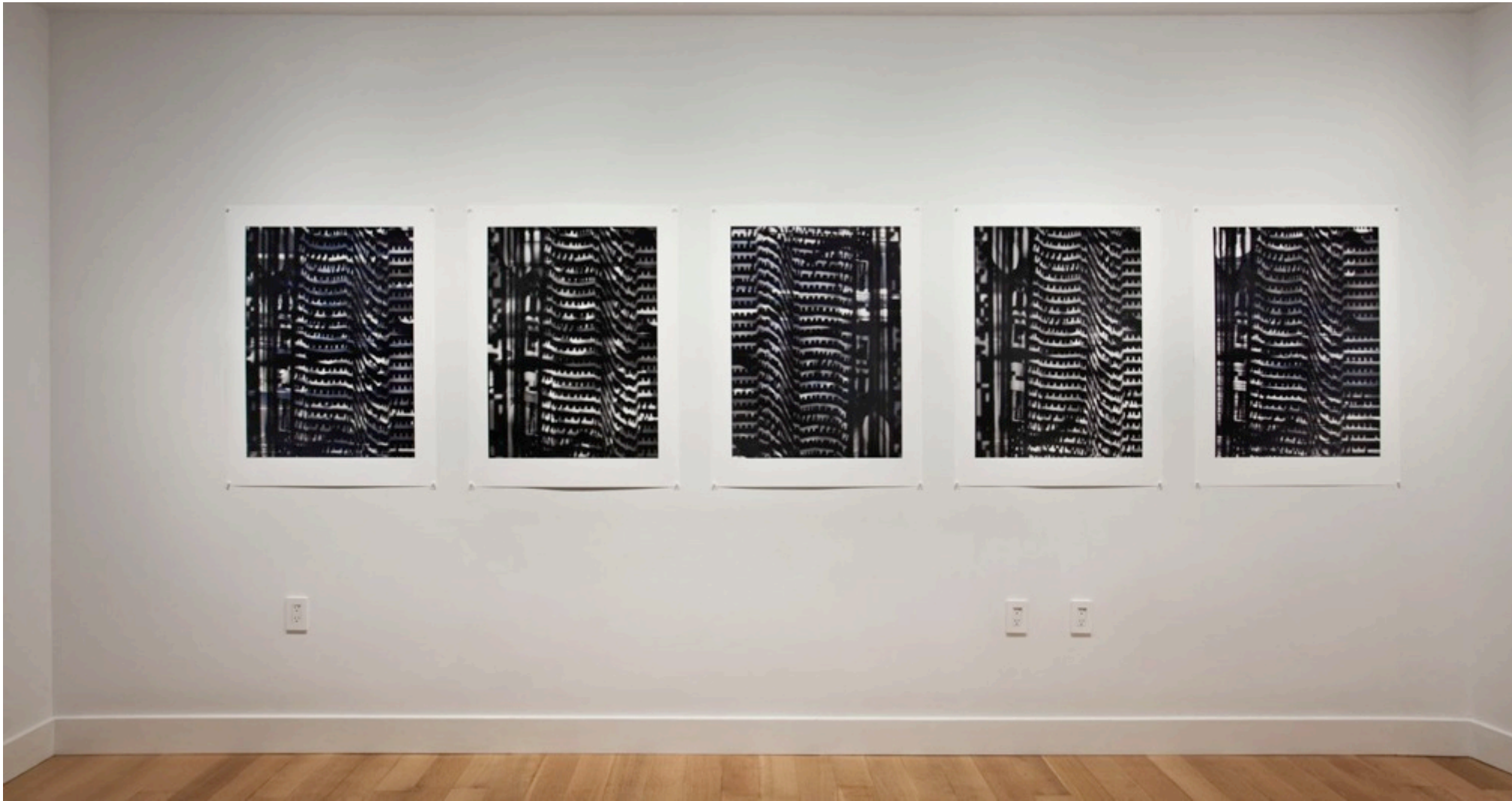
METROPOLIS © 2016 24 x 31" on 30 x 40" paper archival pigment print