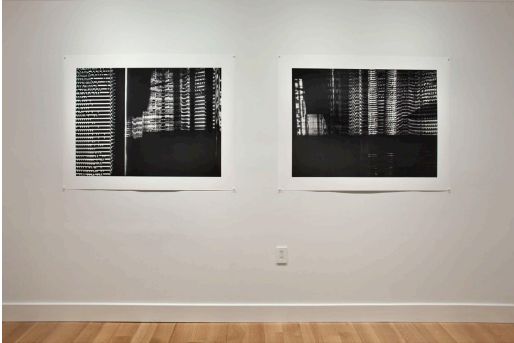
DRAPE © 2016 24 x 31" on 30 x 40" paper archival pigment print